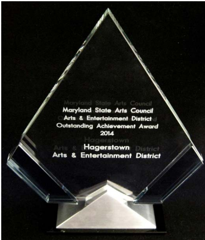
Maryland State Arts Council Arts & Entertainment District Outstanding Achievement Award 2014: Hagerstown Arts & Entertainment District